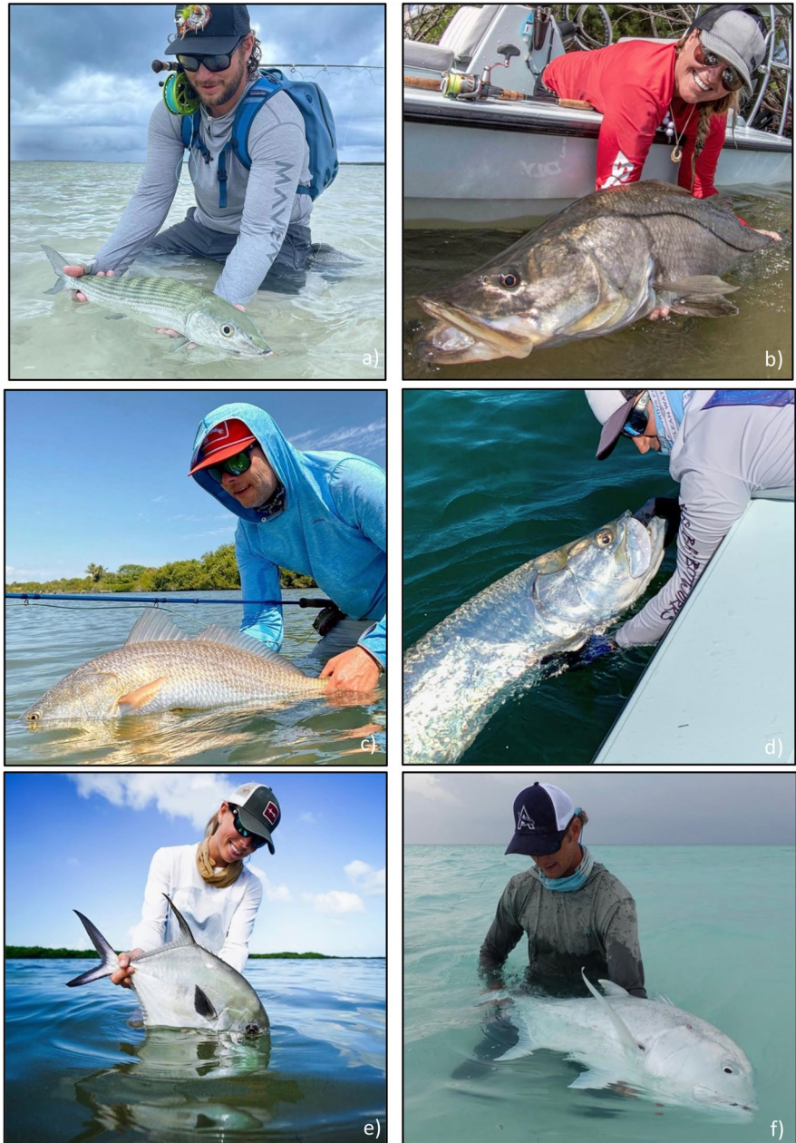
Fig. 1 Images of commonly targeted fish species in the recreational subtropical and tropical flats fishery. (a) Bonefish ( Albula glossodonta). (b) Common snook ( Centropomus undecimalis). (c) Red drum/redfish ( Sciaenops ocellatus). (d) Atlantic tarpon ( Megalops atlanticus). (e) Permit ( Trachinotus falcatus). (f) Giant trevally ( Caranx ignobilis).